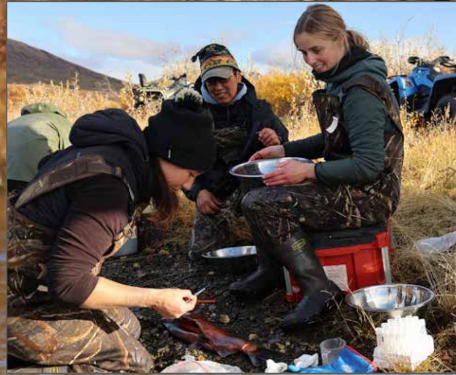
NSEDC FR&D performing egg-take activities at the Snake River as part of salmon restoration activities.

NSFR&D focuses salmon restoration efforts on Snake River coho and Unalakleet River Chinook. At the conclusion of the incubation periods, biologists release the unfed salmon fry back into their rivers of origin. The ability to raise fish to the fry stage creates potential for NSFR&D to expand restoration efforts. Maintaining water quality in areas with limited water sources remains the primary challenge.