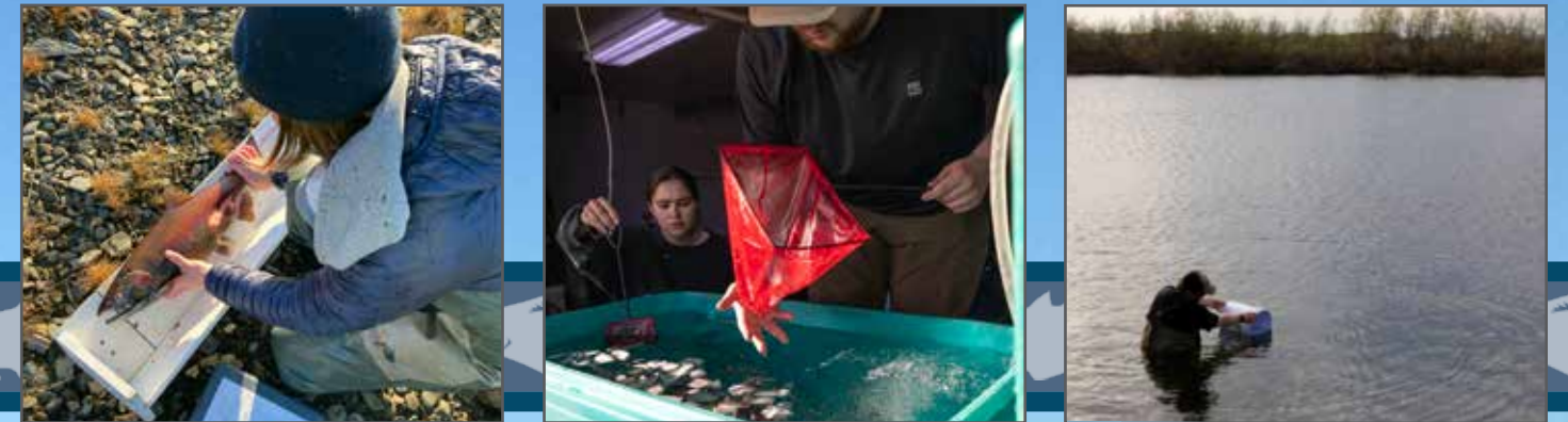
NSFR&D Fisheries Biologists and Fisheries Technicians work through egg-take and fry release projects.

For millennia, Norton Sound residents have relied upon and maintained a sustainable harvest of marine resources. As development and commercial fishing evolve in Norton Sound, NSEDC prioritizes research to continue the tradition of sustainability with the Norton Sound Fisheries Research & Development (NSFR&D) Department. Through enumeration projects and other research, NSFR&D provides valuable data to the agencies that manage the fisheries off our coasts, including the Alaska Department of Fish & Game (ADF&G) and the National Oceanic and Atmospheric Administration (NOAA). By providing data to these agencies, NSEDC aims to support responsible management to maintain sustainable populations of the region’s salmon, red king crab and halibut, among other species. Further, NSEDC conducts restoration and enhancement projects for fisheries, where able, in order to provide additional harvesting opportunity for residents.